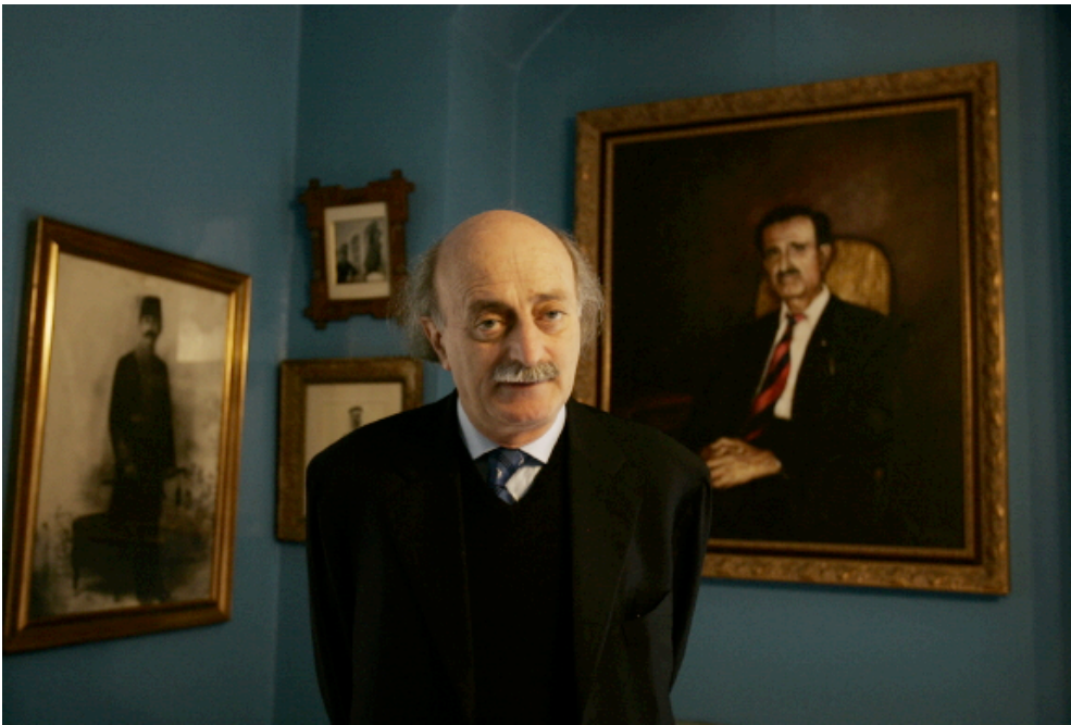
The Druze leader, Walid Jumblatt, at his house in the Chouf Mountains

The UN insider acknowledges that Brammertz “didn’t move as quickly as he should have,” but insists that some progress was made. In part, Brammertz’s more methodical approach was dictated by the creation of the UN Special Tribunal for Lebanon, which began gaining momentum shortly after he arrived in Beirut. Previously, it had been expected that the case would ultimately be prosecuted in a Lebanese court, using the results of the UN investigation as evidence. But after a string of killings of prominent anti-Syrian critics, the Lebanese cabinet asked the Security Council to create a UN tribunal. “There was this feeling that because of these killings, you could not safely carry out such a trial in Lebanon,” the Western diplomat explained to me. “Judges would be blown up, witnesses would be blown up.” As it became clearer that the Hariri case would be tried in an international court, with its very high evidentiary standards, it made sense “to be more discreet,” he said.