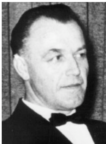
Public domain image